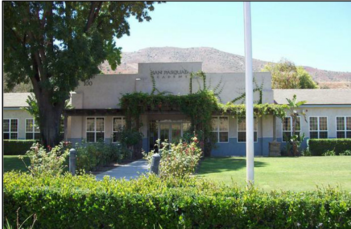
San Pasqual Academy is a first-in-the-nation residential education campus designed specifically for foster teens. The Academy is located in Escondido, CA and provides foster teens with a stable, caring home, a quality, individualized education, and the skills needed for independent living.