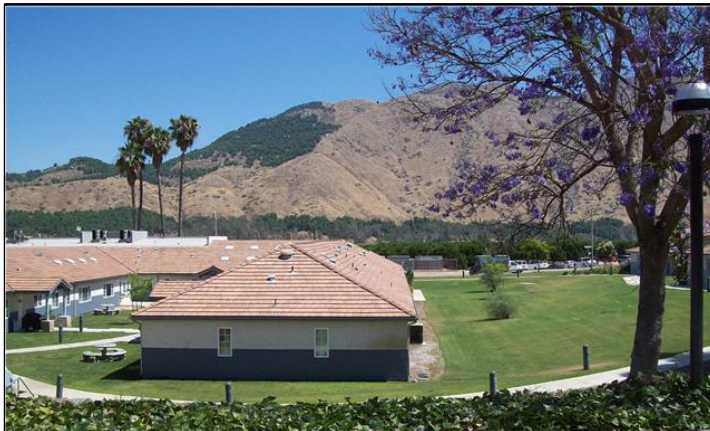
Youth live in family-style homes with up to eight youth per home. The homes are spacious and feature a common living room, kitchen, dining room, laundry space, bedrooms and bathrooms and a suite for the houseparent staff.

enviable graduation rate in the ninety per cent range, and now even has middle school students, siblings of the high school students, living on campus and attending a nearby public school.